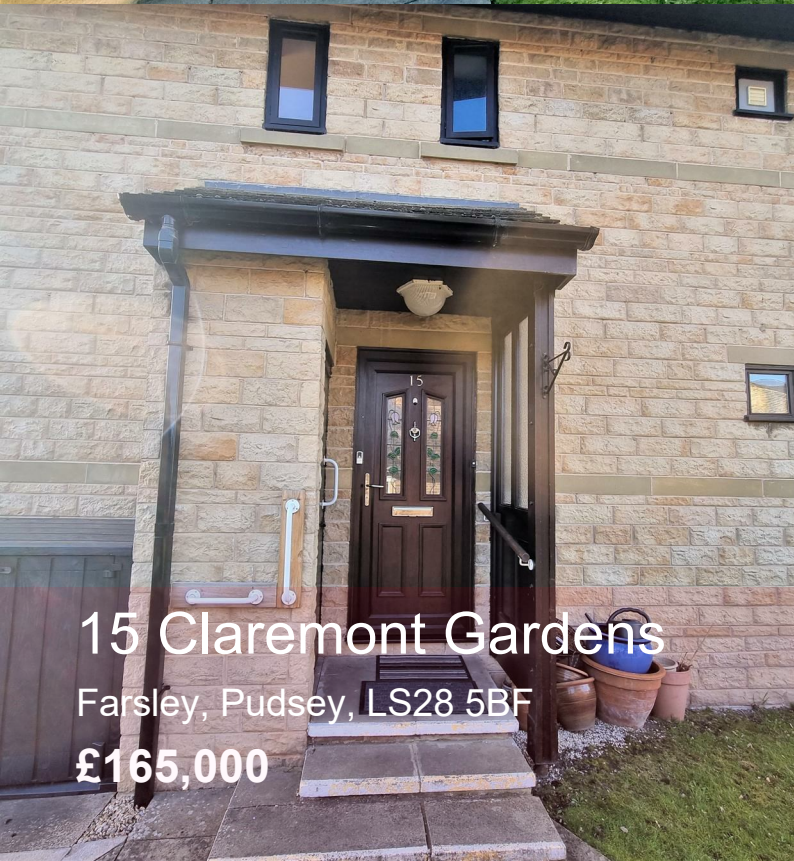
15 Claremont Gardens Farsley, Pudsey, LS28 5BF £165,000